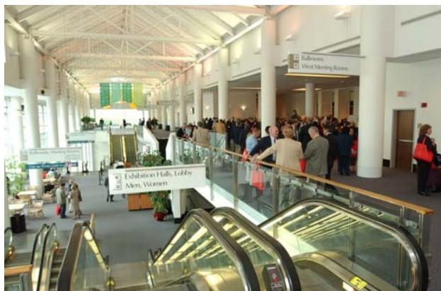
Photograph of the prefunction space of the Ballroom Level of the Rhode Island Convention Center, towards the foyer of the meeting rooms

The Exhibitor Booths will be located in the foyer for the Ballrooms (Attachment 1) and photo, below), along the margins of the main corridor for foot traffic to and from the podium sessions. This should ensure repeated, high-volume exposure as the conference attendees arrive and depart each day, and at the session breaks. In addition, we plan to place the food service buffet tables in the prefunction space, which should retain the attendees in the vicinity of the exhibitor booths to a degree during the breaks and lunches.