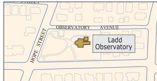
LADD OBSERVATORY 1" = 300'