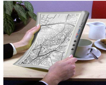
Fig. 1. An artist's rendition of a electronic paper display, which undergoes mechanical strain in more than one dimension.

Results from the biaxial electromechanical evaluation of the thin film electrodes show that the thin metal film electrodes remain conductive with no noticeable change in electrical resistance (Fig. 3), as desired for applications.