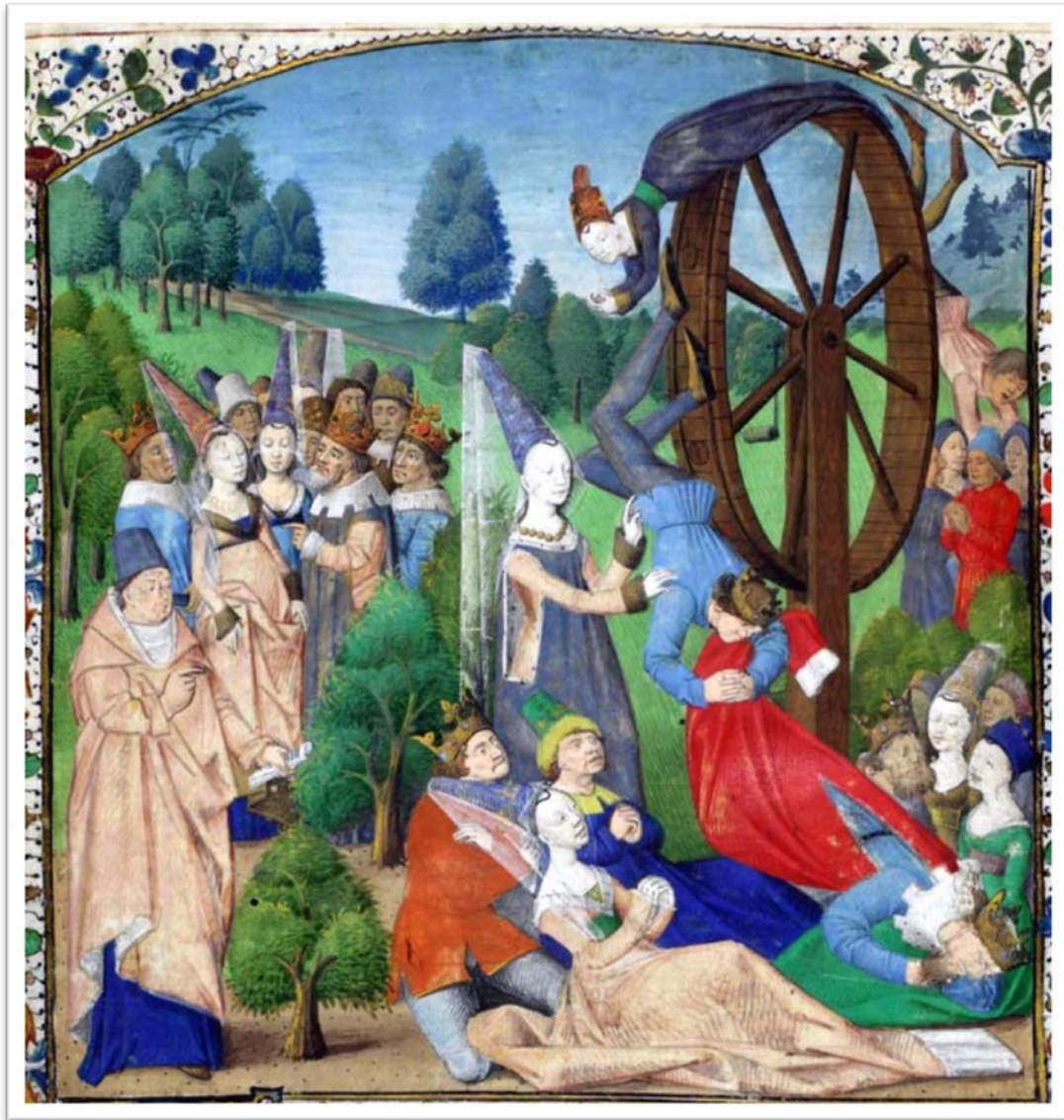
Figure 1. Miniature depicting Fortune and her Wheel. School of the Coëtivy Master. Detail. Les cas des nobles hommes et femmes . Translated into French by Laurence de Premierfait. University of Glasgow. MS Hunter 371, fol. 1 r . 1467.