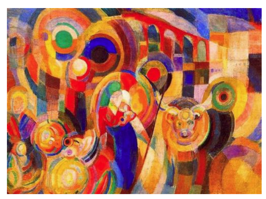
Figure 5 : Sonia Delaunay, Marché au Minho , 1915 [https://www.wikiart.org/en/sonia-delaunay/market-at-minho]

encountered in the markets, capturing the colors and movement of those spaces in works like Marché au Minho (1916).