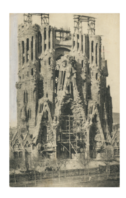
Figure 1: Postcard from Mário de Sá-Carneiro to Fernando Pessoa Barcelona, September 6, 1914 (Sá - Carneiro, 2015: 279)

From Barcelona, he would then travel to Madrid and finally on to Lisbon, where he would arrive on 9 September.<sup>6</sup>