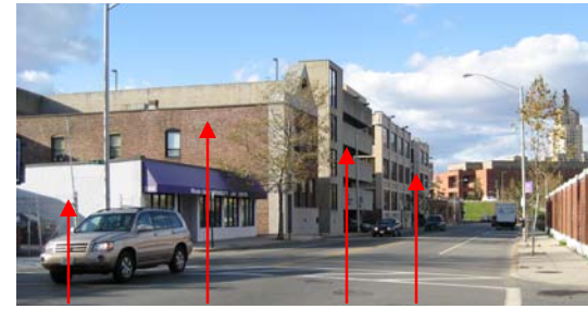
349 Eddy 339 Eddy Garage 222 Richmond