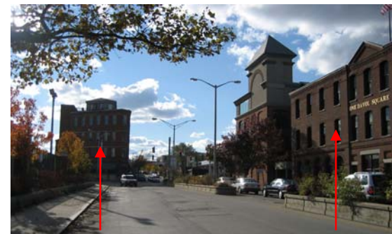
10 Davol Square One Davol Square