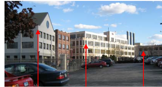
196 Richmond 222 Richmond 233 Richmond

These properties currently include a mix of tenants, including storefront retail, commercial offices, small executive suites, and several Brown University administrative offices. The University's intent is to continue this mix of uses in all of the buildings listed above, although there will be some consolidation of the Brown administrative offices currently located in the Jewelry District to 222 Richmond Street.