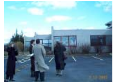
View from front parking to Office