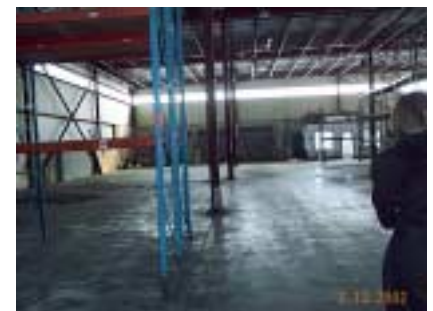
View of high bay space