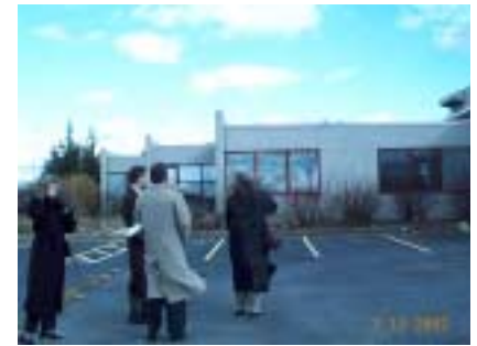
View from front parking to Office