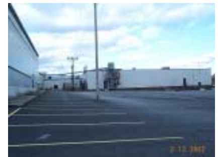
View from rear parking - High Bay on left, Storage straight ahead