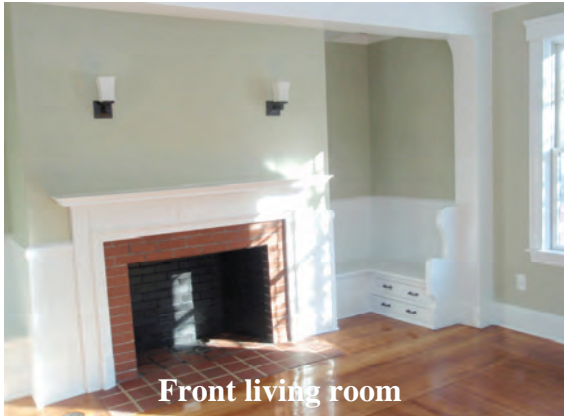
Front living room