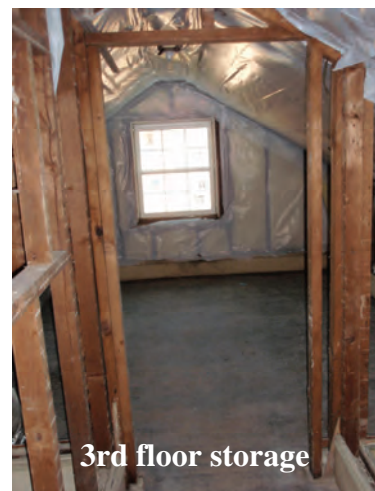
3rd floor storage