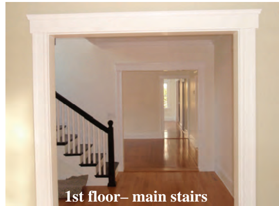
1st floor— main stairs