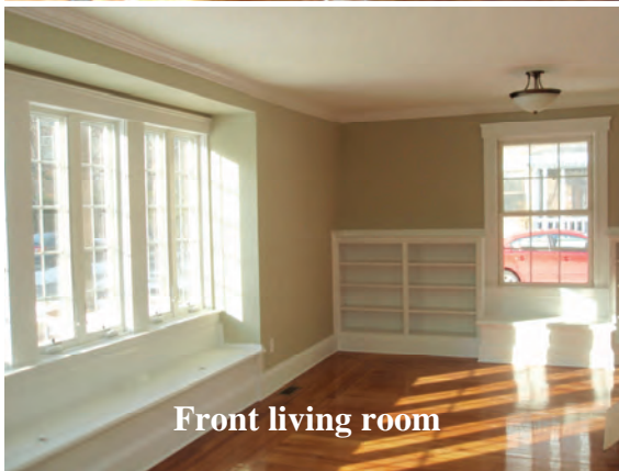
Front living room