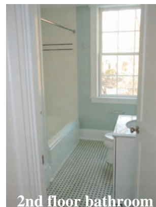
2nd floor bathroom