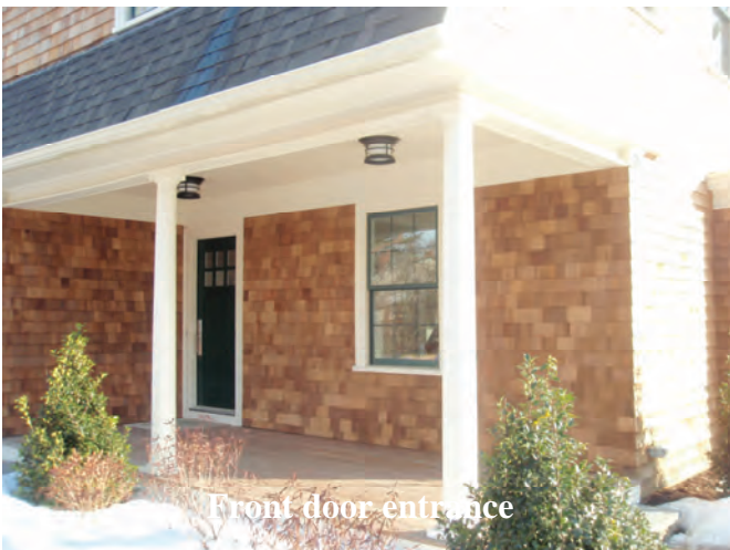
Front door entrance