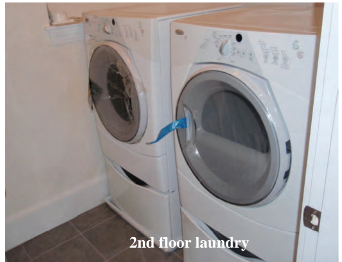
2nd floor laundry