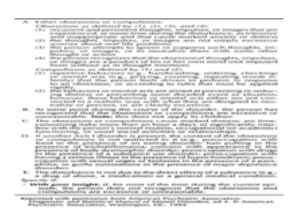
Table 15.6-10 DSM-IV Diagnostic Criteria for Obsessive-Compulsive Disorder

Obsessions and compulsions are the essential features of OCD. As shown in <u>Table 15.6-10</u>, an individual must exhibit either obsessions or compulsions to meet DSM-IV criteria. DSM-IV recognizes obsessions as "persistent ideas, thoughts, impulses, or images that are experienced as intrusive and inappropriate," causing distress. Obsessions are anxiety provoking, accounting for the categorization of OCD as an anxiety disorder; they must be differentiated from excessive worries about real life problems; and they must be associated with either efforts to ignore or suppress the obsessions. Typical obsessions associated with OCD include thoughts about contamination ("my hands are dirty") or doubts ("I forgot to turn off the stove").