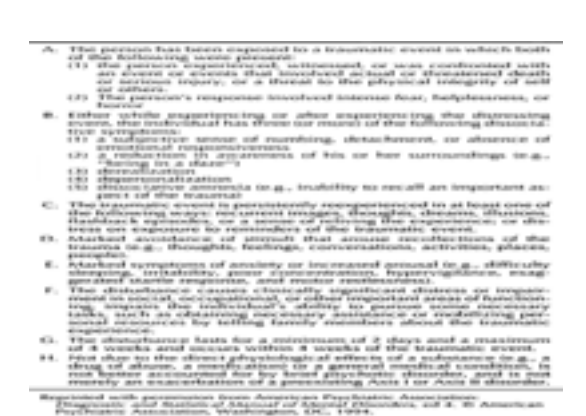
Table 15.6-13 DSM-IV Diagnostic Criteria for Acute Stress Disorder

The diagnosis of acute stress disorder is applied to syndromes that resemble PTSD but last less than 1 month after a trauma. Acute stress disorder is characterized by reexperiencing, avoidance, and increased arousal, much like PTSD. Acute stress disorder is also associated with at least three of the dissociative symptoms listed in <u>Table 15.6-13</u>.