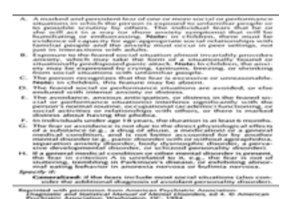
Table 15.6-9 DSM-IV Diagnostic Criteria for Social Phobia

Table 15.6-8 DSM-IV Diagnostic Criteria for Specific Phobia