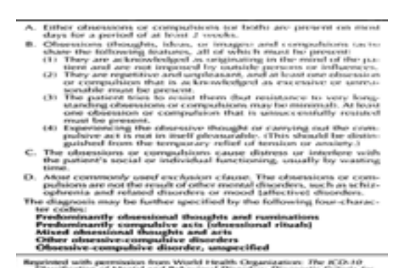
Table 15.6-11 ICD-10 Diagnostic Criteria for Obsessive-Compulsive Disorder

The major change in OCD from DSM-III to DSM-IV involved the conceptualization of compulsions. While DSM-III-R viewed compulsions as behaviors, DSM-IV recognized compulsions as either behaviors or mental acts designed to reduce the anxiety-provoking nature of the obsession. The conceptualization of OCD in the ICD and DSM systems is generally similar with a few exceptions in the emphasis on specific features of the condition. For example, ICD-10 emphasizes that a compulsive act must not be pleasurable. ICD-10 also stipulates that obsessions or compulsions must be present most days for 2 weeks, a requirement not included in DSM-IV, and ICD-10 does not stipulate the amount of time a patient must spend on compulsions. Perhaps the major difference between the DSM-IV and ICD-10 view of the disorder relates to the categorization of the disorder with respect to other anxiety disorders. DSM-IV recognizes OCD as one of the nine anxiety disorders discussed in the current chapter. There has been some debate in the United States and Europe about whether OCD is more properly classified in a distinct category. ICD-10 has adopted such a scheme, using OCD to designate a group of syndromes considered distinct from anxiety disorders (Table 15.6-11).