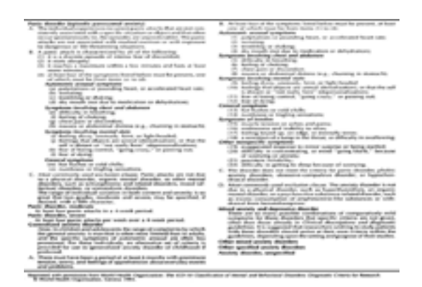
Table 15.6-7 ICD-10 Diagnostic Criteria for Other Anxiety Disorders

Differential Diagnosis Panic disorder with or without agoraphobia must be differentiated from a number of medical conditions that produce similar symptomatology. Panic attacks are associated with a variety of endocrinological disorders, including both hypo- and hyperthyroid states, hyperparathyroidism, and pheochromocytomas. Episodic hypoglycemia associated with insulinomas can also produce paniclike states, as can primary neuropathological processes. These include seizure disorders, vestibular dysfunction, neoplasms, or the effects of both prescribed and illicit substances on the central nervous system. Finally, disorders of the cardiac and pulmonary systems, including arrhythmias, chronic obstructive pulmonary disease, and asthma, can produce autonomic symptoms and accompanying crescendo anxiety that can be difficult to distinguish from panic disorder. Clues of an underlying medical cause for paniclike symptoms include atypical features during panic attacks, such as ataxia, alterations in consciousness, or bladder dyscontrol; onset of panic disorder relatively late in life; or physical signs or symptoms indicating a medical disorder.