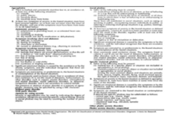
Table 15.6-6 ICD-10 Diagnostic Criteria for Phobic Anxiety Disorders

phobic disorders and does not emphasize the relationship with panic disorder to the same degree as DSM-IV. <u>Table 15.6-6</u> presents the ICD-10 diagnostic criteria for phobic anxiety disorders, including agoraphobia. <u>Table 15.6-7</u> presents the ICD-10 criteria for other anxiety disorders, including panic disorder.