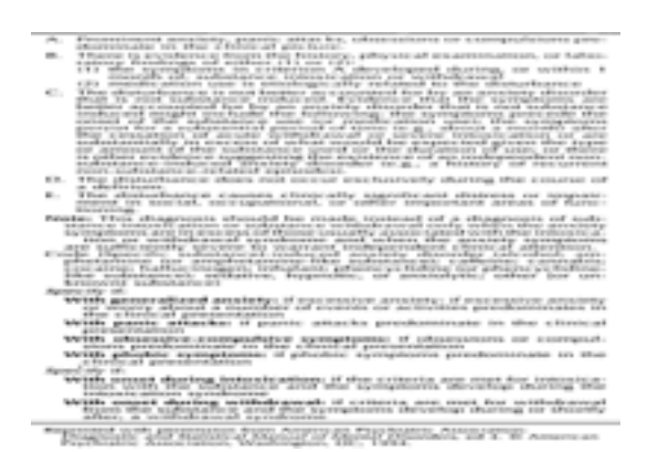
Table 15.6-16 DSM-IV Diagnostic Criteria for Substance-Induced Anxiety Disorder

These conditions are characterized by prominent anxiety that arises as the direct result of some underlying physiological perturbation. Hence, for patients with substance-induced anxiety disorder (Table 15.6-16), clinically significant symptoms of panic, worry, phobia, or obsessions emerge in the context of prescribed or illicit substance use. For example, both prescribed and illicit sympathomimetic substances can often produce relatively marked degrees of anxiety. Similarly, for anxiety due to a general medical condition (Table 15.6-17), symptoms develop in the context of an identifiable medical syndrome. For example, panic attacks have been tied to various medical conditions, including endocrinologic, cardiac, and respiratory illnesses.