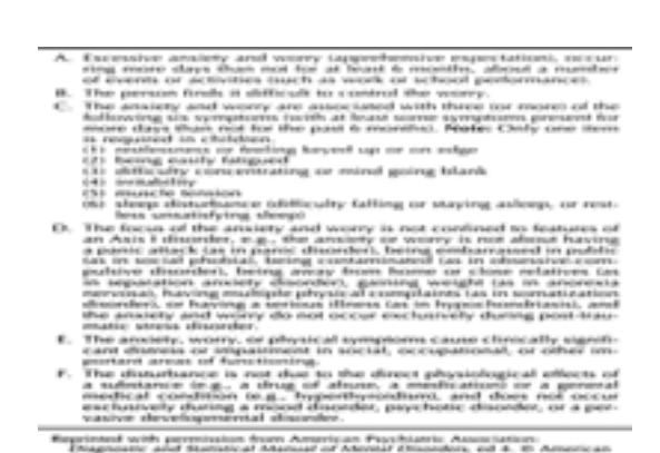
Table 15.6-15 DSM-IV Diagnostic Criteria for Generalized Anxiety Disorder

Generalized anxiety disorder is characterized by a pattern of frequent, persistent worry and anxiety that is out of proportion to the impact of the event or circumstance that is the focus of the worry (Table 15.6-15). For example, while college students often worry about examinations, a student who persistently worries about failure despite consistently outstanding grades displays the pattern of worry typical of generalized anxiety disorder. Patients with generalized anxiety disorder may not acknowledge the excessive nature of their worry, but they must be bothered by their degree of worry. This pattern must occur "more days than not" for at least 6 months. The patients must find it difficult to control this worry and must report at least three of six somatic or cognitive symptoms, including feelings of restlessness, fatigue, muscle tension, or insomnia. Worry is a ubiquitous feature of many anxiety disorders: patients with panic disorder often worry about panic attacks, patients with social phobia worry about social encounters, and patients with OCD worry about their obsessions. The worries in generalized anxiety disorder must be beyond the those that characterize these other anxiety disorders. Children exhibiting characteristic symptoms are also considered to meet criteria for generalized anxiety disorder, but they need only meet one of the six somatic or cognitive symptom criteria rather than three.