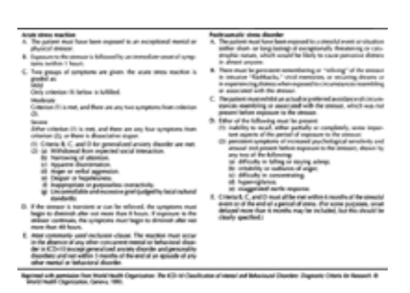
Table 15.6-14 ICD-10 Diagnostic Criteria for Reactions to Severe Stress

Some variation exists in the definitions of PTSD and acute stress disorder in DSM-IV and ICD-10. While ICD-10 acknowledges the same core group of symptoms as DSM-IV for PTSD, including exposure to a trauma, reexperiencing, avoidance, and increased arousal, ICD-10 provides considerably less detail than DSM-IV for each of the criteria. For example, unlike DSM-IV, ICD-10 provides only brief examples of reexperiencing or avoidance symptoms. The broader view of PTSD and acute stress disorder also differs in the DSM and ICD systems. As with OCD, ICD-10 groups PTSD and acute stress reaction in a distinct category rather than including them with other anxiety disorders (Table 15.6-14).