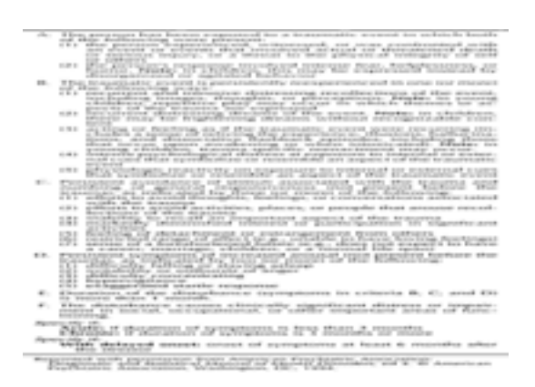
Table 15.6-12 DSM-IV Diagnostic Criteria for Posttraumatic Stress Disorder

Symptomatology Both PTSD and acute stress disorder are characterized by the onset of psychiatric symptoms immediately following exposure to a traumatic event. As noted in <u>Table 15.6-12</u>, DSM-IV specifies that the traumatic event involves either witnessing or experiencing threatened death or injury or witnessing or experiencing threat to physical integrity. Further, the response to the traumatic event must involve intense fear or horror. Such traumatic experiences might include being involved in or witnessing a violent accident or crime, military combat, assault, being kidnapped, being involved in natural disasters, being diagnosed with a life-threatening illness, or experiencing systematic physical or sexual abuse. Both PTSD and acute stress disorder also require characteristic symptoms following such trauma. There is evidence of a relation between the degree of trauma and the likelihood of symptoms. The proximity to, and intensity of, the trauma relate to the probability of developing symptomatology.