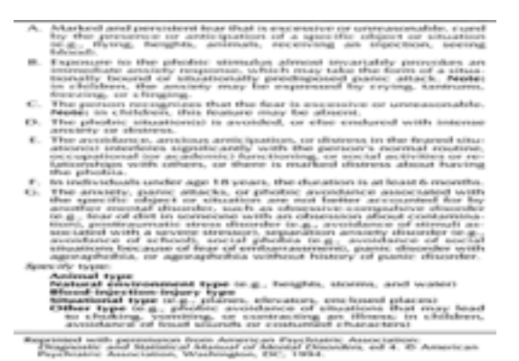
Table 15.6-8 DSM-IV Diagnostic Criteria for Specific Phobia

that fear either interferes with functioning or causes marked distress. Finally, both conditions require that an individual recognizes the fear as excessive or irrational and that the feared object or situation is either avoided or endured with great difficulty.