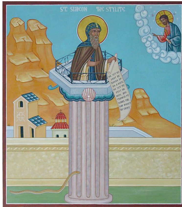
Saint Simeon Stylites (37 years...)