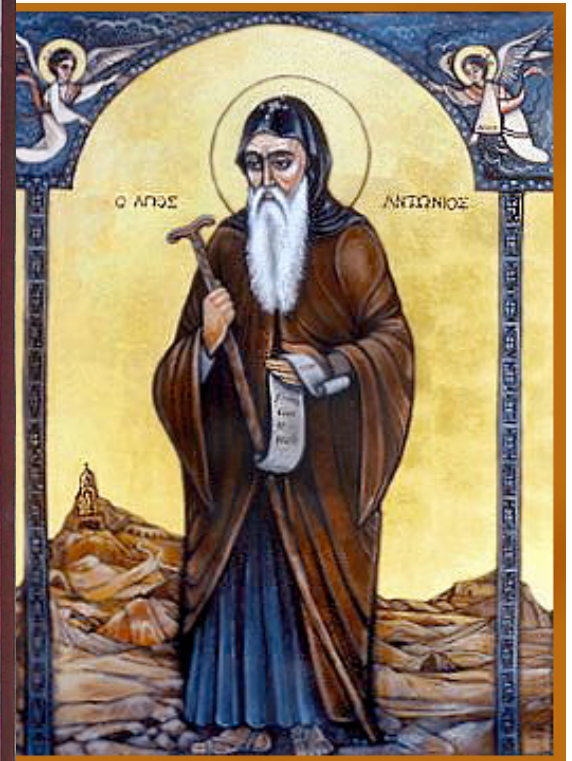
St. Anthony, Egypt