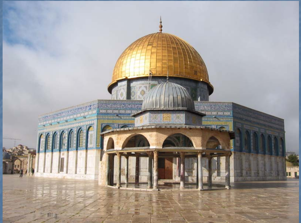
Dome of the Rock - Jerusalem