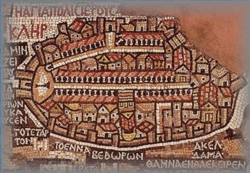
Jerusalem Medallion from the Madaba Mosaic Map, 7 th c, Jordan