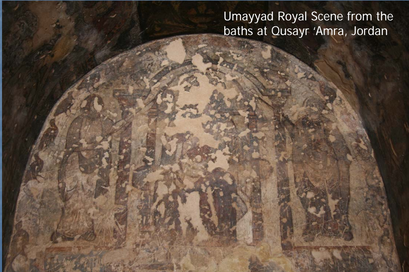
Umayyad Royal Scene from the baths at Qusayr 'Amra, Jordan