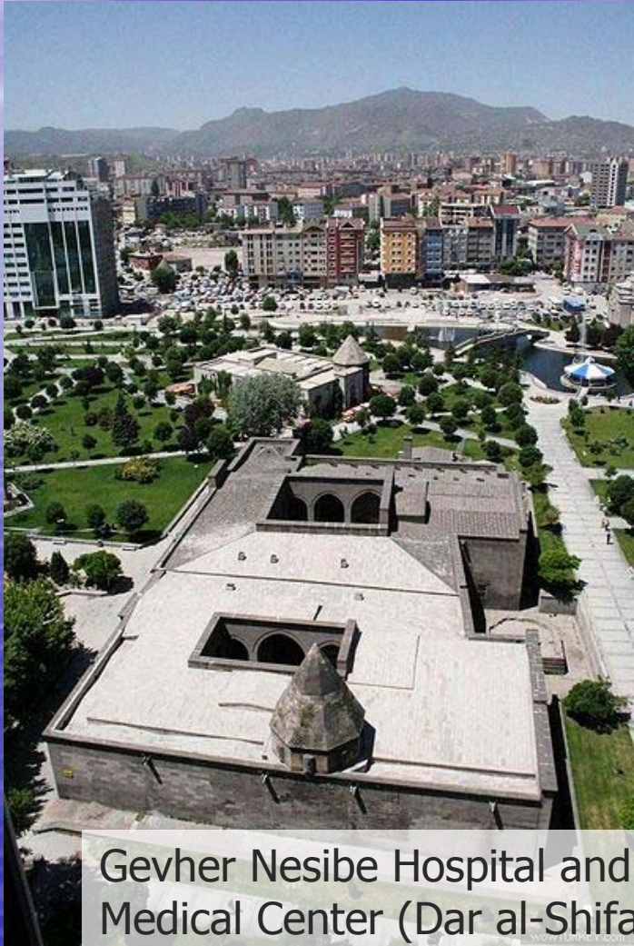
Gevher Nesibe Hospital and Medical Center (Dar al-Shifa) and Medical School (Medrese) complex (külliye) in Kayseri,