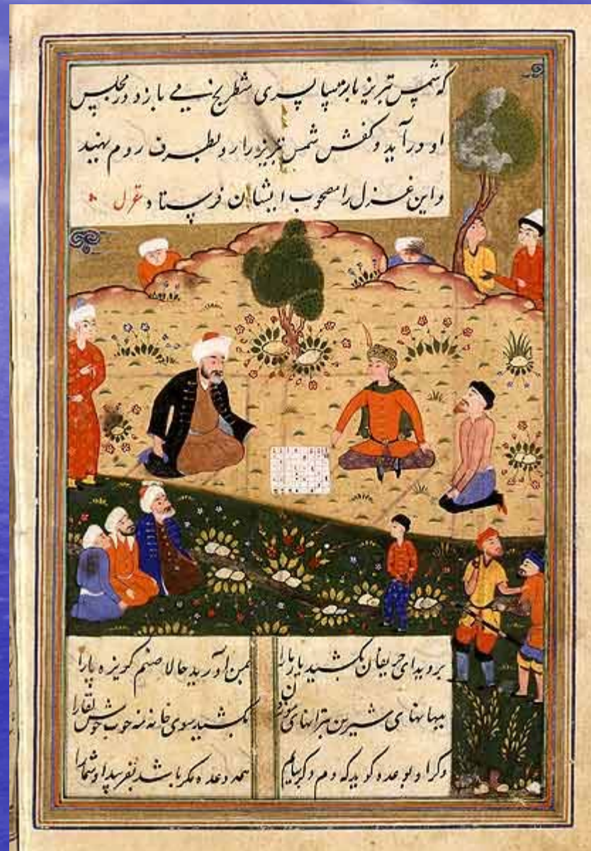
Shams of Tabriz as portrayed in a 1500 painting in a page of a copy of Rumi's poem dedicated to Shams. BNF Paris.