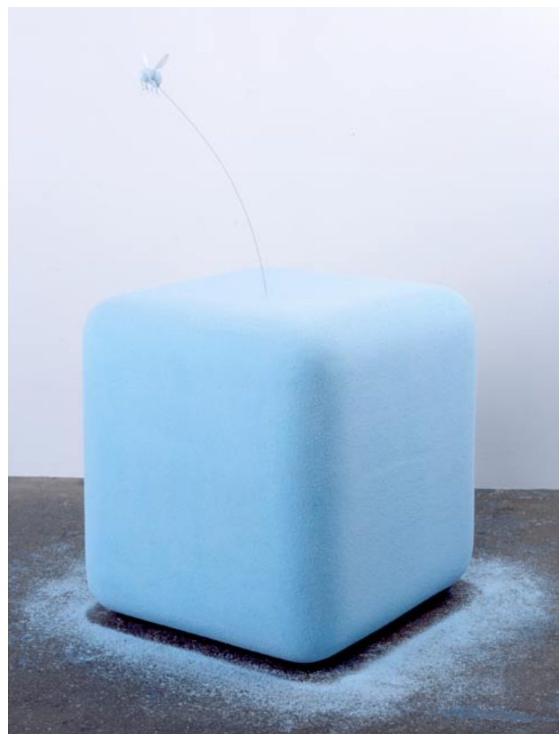
Tom Friedman, Untitled , 2005

Heide Fasnacht used styrofoam to make the body, wings, tail, and various fragments of her Exploding Airplane , which hangs from the ceiling and is tethered to the walls of the gallery. She says that "this material allowed for fast, intimate handwork, not unlike carving marble, only friendlier." Because the sculpture is very large and needs to be suspended, weight was also an important factor in choosing styrofoam. The explosion is made with urethane foam, a related material chosen in part because the way foam bursts out of the can is similar to the