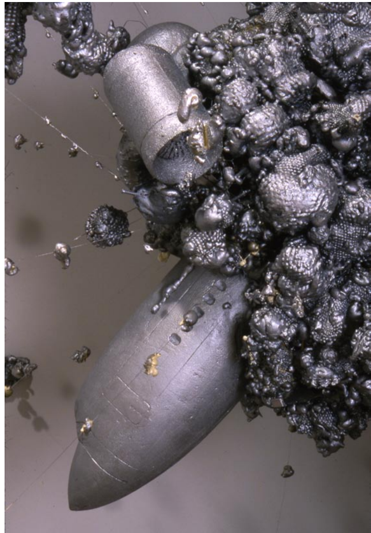
Heide Fasnacht, Exploding Airplane (detail) , 2000