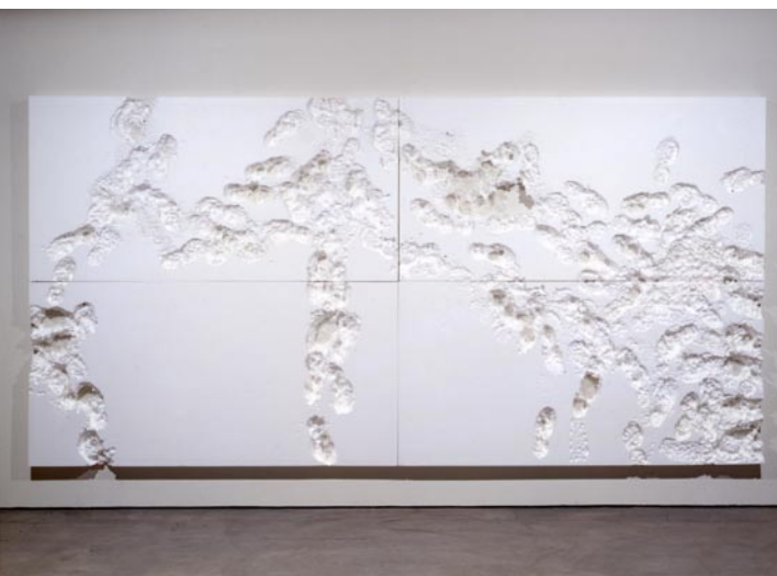
Rudolf Stingel, Untitled , 2000. Styrofoam, four elements: each 48 x 96 x 4 inches; overall 96 x 192 x 4 inches. Collection of Anstiss and Ron Krueck. Courtesy of the artist and Paul Cooper Gallery, New York. Not in exhibition