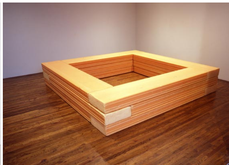
Carl Andre, Compound , 1965. Styrofoam beams: each 9 x 21 x 108 inches; overall 27 x 129 x 129 inches. Courtesy of the artist and Paula Cooper Gallery, New York. © Carl Andre/licensed by VAGA, New York. Not in exhibition

A number of them re-use pre-existing elements that they find unexpectedly in the course of their daily activities, whereas others start with large industrial sheets. The ways in which they adapt or transform the material, whether purchased or found, may or may not contrast with its original intended function.