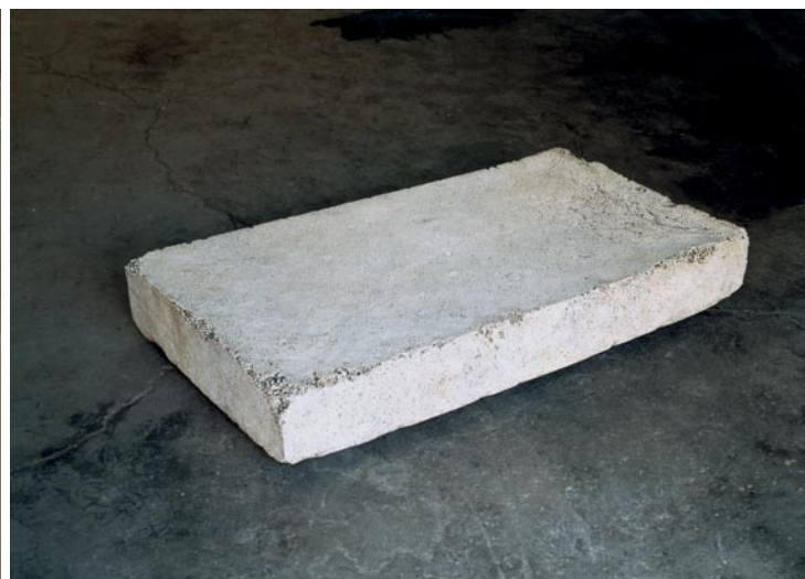
Robert Gober, Untitled , 2000–01. Bronze and paint, 7 x 25 x 47 1/4 inches. © Robert Gober, courtesy of the artist and Matthew Marks Gallery, New York. Photo by Liz Deschenes. Not in exhibition

side. That is my starting point and it becomes for me a unique artistic medium to reflect on the subjects of dark human drama and complex social and political realities in a most efficient way. 7