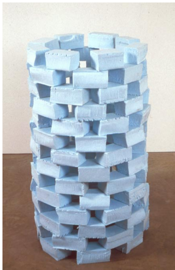
Tony Feher, Blue Tower , 1997

bags, socks, and tin cans. Here, molded packaging is transformed into mysterious architectural plazas or interiors. Ancient mastabas, pyramids, and Stonehenge-like monoliths bear the unmistakable beaded surface of expanded polystyrene. Wurtz used styrofoam as early as 1970, and in 1979 he made two Super 8 films, titled My Styrofoam and I Took It , in which the material served as props.