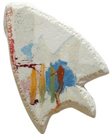
Richard Tuttle, Lonesome Cowboy Styrofoam #5 and Lonesome Cowboy Styrofoam #7 , 1988. © 2007 Richard Tuttle