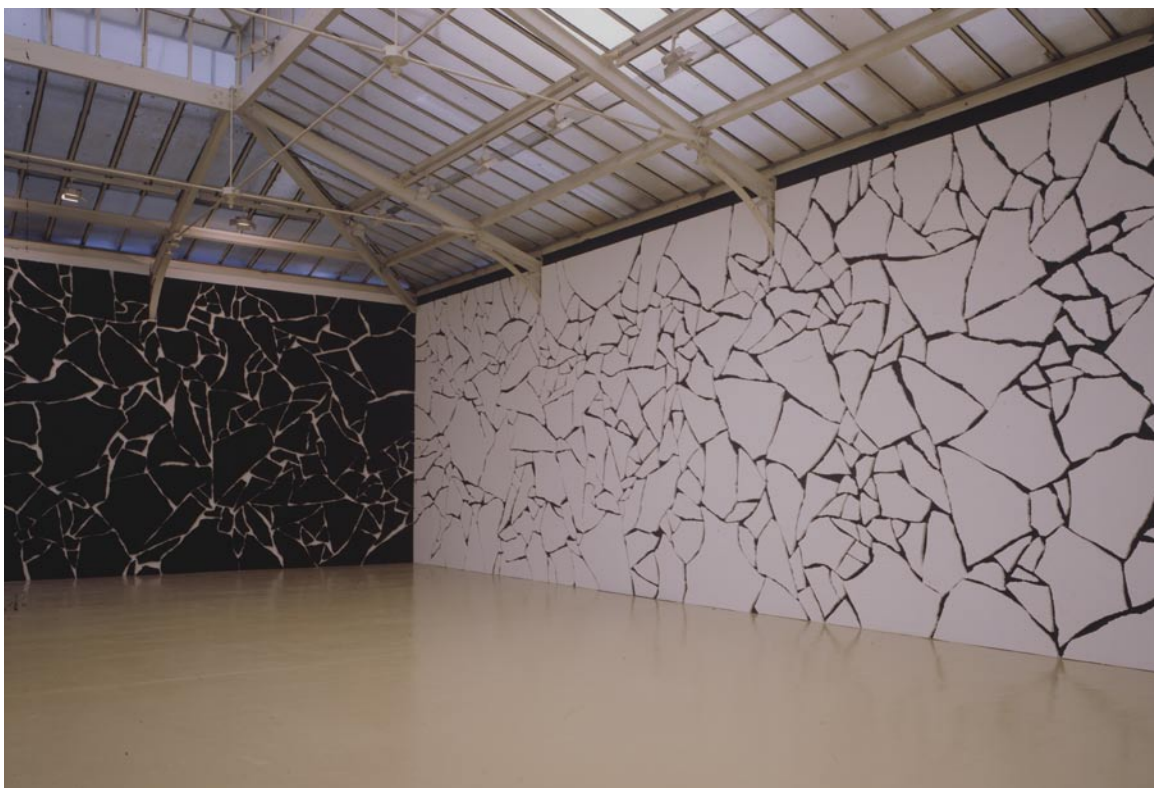
Sol LeWitt, Black Styrofoam on White Wall and White Styrofoam on Black Wall, 1993. Installation at Galerie Yvon Lambert, Paris, 1993