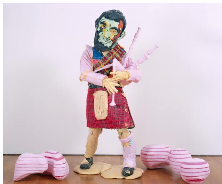
Folkert de Jong, The Piper , 2007. © Folkert de Jong

I like to call it an anti-material. It is manufactured in such an economical way that it uses tiny little raw material to become very voluptuous and massive.... It reflects mass consumption, and market economy in the extreme.... I carefully choose these materials for two contradicting reasons: For its immoral content and because of its tantalizing sweetness, human body-related colours, attractive texture and its very specific gravity and the possibilities they offer to use them in a sculptural way... the meaning of the materials start to emerge above the technical possibilities and start to show its most politically incorrect