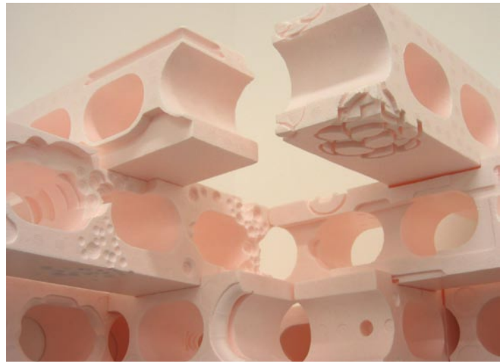
Shirley Tse, Do Cinderblocks Dream of Being Styrofoam? (detail) , 2003

Edited by Amy Pickworth Designed by Julie Fry Printed by Meridian Printing © 2008 Museum of Art, Rhode Island School of Design