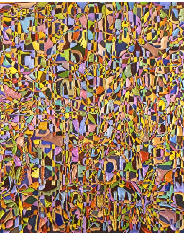
Bruce Pearson, Encyclopedia I (Clues Scattered from Charred Remains a Father's Plea False Names) , 2003. © Bruce Pearson.

frequently used for building theater sets—instead. Working with a hot wire as thin as pencil lead, Pearson cuts the layered styrofoam into a myriad of tesserae-like shapes to create astonishingly eye-popping compositions. Pearson found that this method provided greater stability and flexibility to refine the surfaces of his paintings. In the compositions, which may appear at first to be abstract, phrases and sentences are woven skillfully into all-over, oscillating patterns. Quirky in content and physically distorted in form, these words, taken from various mass-media sources, also serve as titles for the paintings.