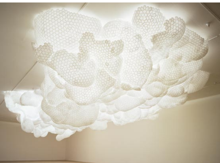
Tara Donovan, Untitled , 2003. Styrofoam cups and glue. Installation at Ace Gallery. Not in exhibition