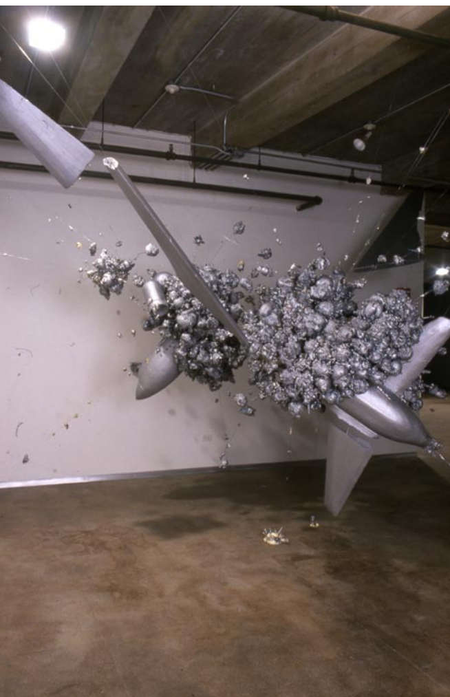
Heide Fasnacht, Exploding Airplane , 2000. Installation at Bill Maynes Gallery, New York, 2000

explosive event she wanted to depict. Fasnacht's focus on the environment in which we live ranges from monumental and horrific events such as a plane crash or an imploding building (also realized in styrofoam) to the everyday occurrence of a sneeze. The sneeze may be infinitely more common, but it is similarly explosive, and can have widespread and sometimes catastrophic ramifications.