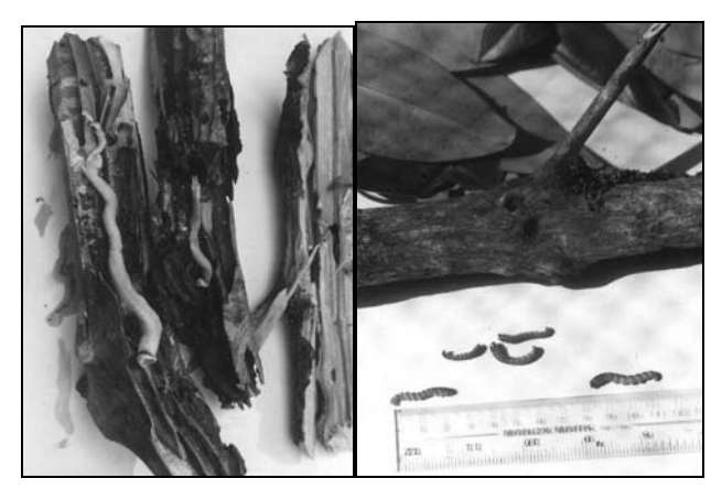
Figure 1: Bankia saulii (left) and Rhizophora stem borer (Zeuzera sp.; right)

The macaques fed on crabs of two families: Grapsidae and Ocypodidae. At least six species are eaten: Helice tridens, Metaplax longipes, Sesarma bidens, Uca lactera, U. arculata , and U. crassipes . Macaques waded into the mud to look for Solen gouldi (razor clams), which occur intensively under mangrove leaf canopy (Nhuong, 1996).