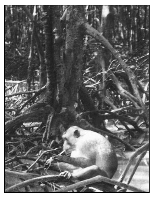
Figure 2: Male eating an octopus.

They gouged out the thin, soft, moist bark of Rhizo-phora spp. with their teeth, leaving scars on the trunks. Bark can also provide water (Richard, 1967, pp. 82-94). Macaques never fed on any part of Excoecaria agallocha , a small tree that has poisonous latex sap.