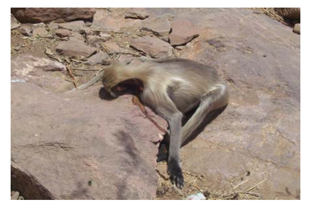
Figure 3: Male killed in an encounter with troop B-1 (Daijar).

<u>April 6:</u> The alpha male of AMB-1 was observed with a severe fresh injury on his face, which indicated that there might have been a fight between the B-1's resident male and the AMB-1 members. After this, AMB-1 kept their distance from B-1's resident male.