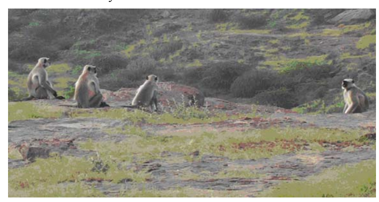
Figure 2: Several members of bisexual troop B-1. Resident male is on the right.

rainfall ca 390 mm) and extremes of temperature (hot summers with maximum temperatures up to 50° C and cold winters with minimum temperatures of 0° C). The langur population around Jodhpur is geographically isolated. The troops are distributed over a 30-km diagonal ridge running from the village of Chonkha in the west to Daijar in the northwest, passing through Jodhpur Fort (Fig. 1). This genetically isolated pocket population of about 2,007 langurs is organized in 53 groups: 38 bisexual troops and 15 all-male bands (Rajpurohit et al., 2010). The total area used by these animals is about 150 \text{ km}^2 . There are no other langur troops within a radius of 100 km. Water is available throughout the year for all the troops through artificial lakes, tanks, and ponds. Langur troops dwell close to human habitation and people regularly feed the monkeys. These animals are easy to observe, as they are not shy and are visible on the ground for most of the day.