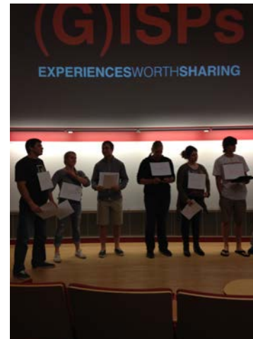
Spring '14 (G)ISP Talks

“Let the student coordinators of all areas within the CRC know that the work you all are doing is so important and essential for those of us who come to you, be it for a semester off, an independent concentration, sophomore advising, or what have you.” [Class of 2015.5 leavetaker]