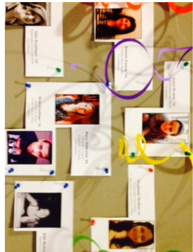
Congratulations, Class of 2014 CRCers!

Curricular Resource Center Brown University Stephen Robert '62 Campus Center 75 Waterman Street, room 228 Box 1825, Providence, RI 02912