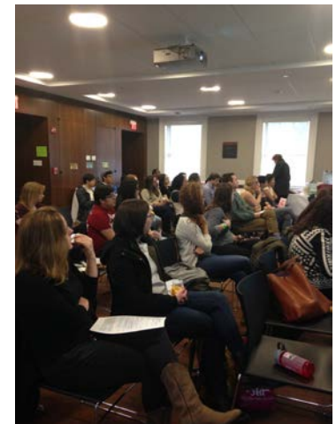
TiA group presentation