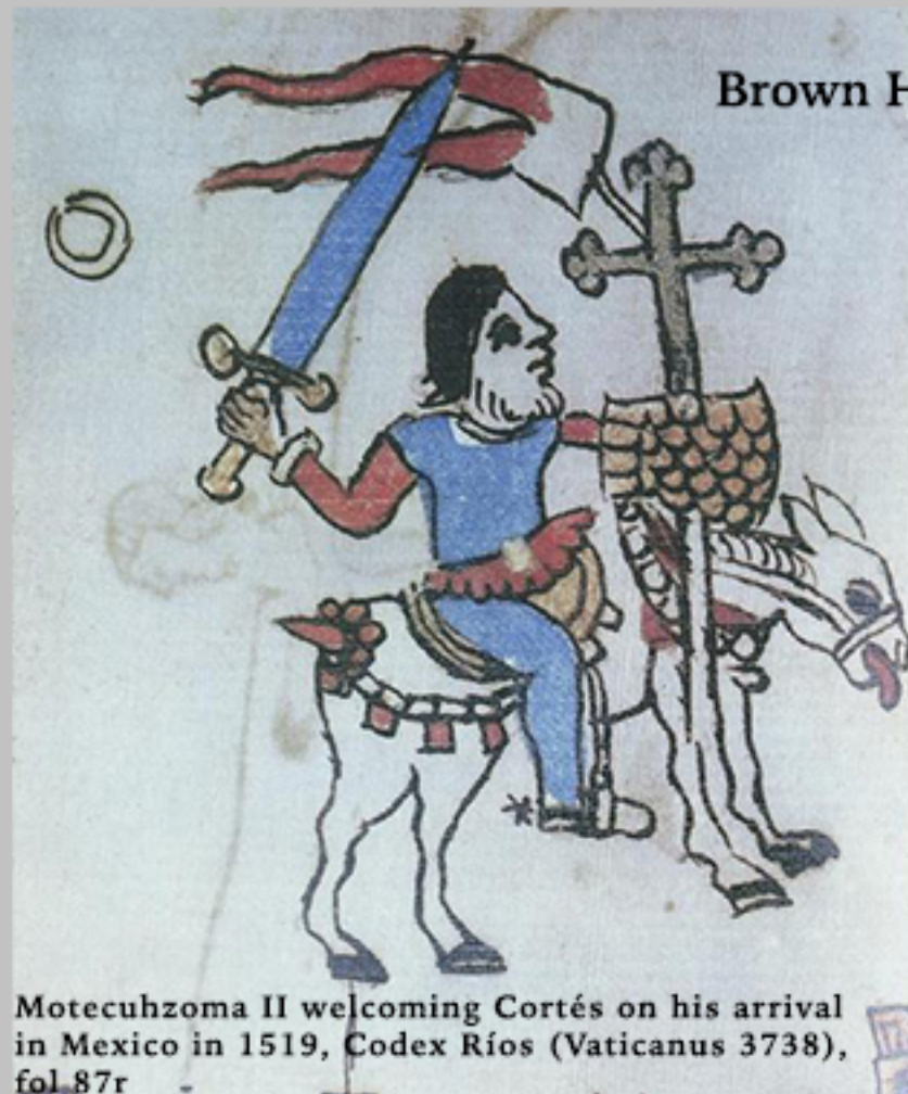
Motecuhzoma II welcoming Cortés on his arrival in Mexico in 1519, Codex Ríos (Vaticanus 3738), fol. 87r