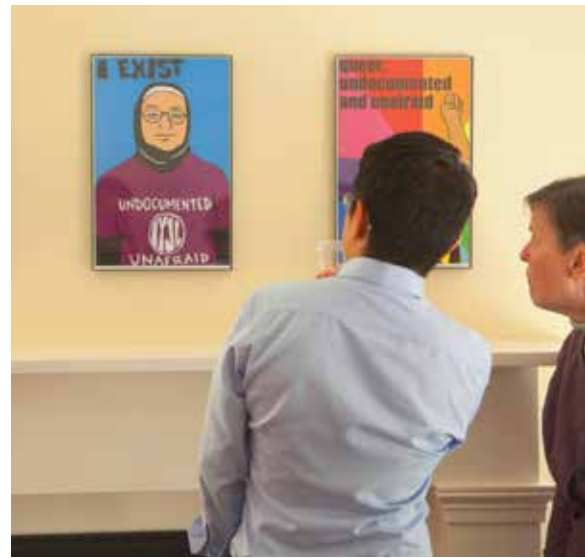
Exhibit: CultureStr/ke September 25, 2013 - February 25, 2014

From the criminalization of migrants through deportation to the undocumented and queer intersectionality, this multi-artist exhibit explored and reflected on different aspects of the immigrant experience. CultureStr/ke is a national network of professional and emerging artists, social change experts, and creative producers who seek to support the national and global arts movement around immigration.