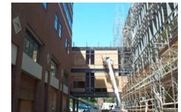
New Life Sciences Building under construction