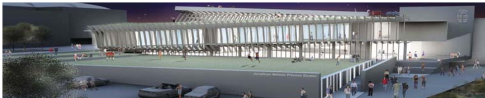
Jonathan Nelson Fitness Center model

Do you have a suggestion for Improving Facilities?