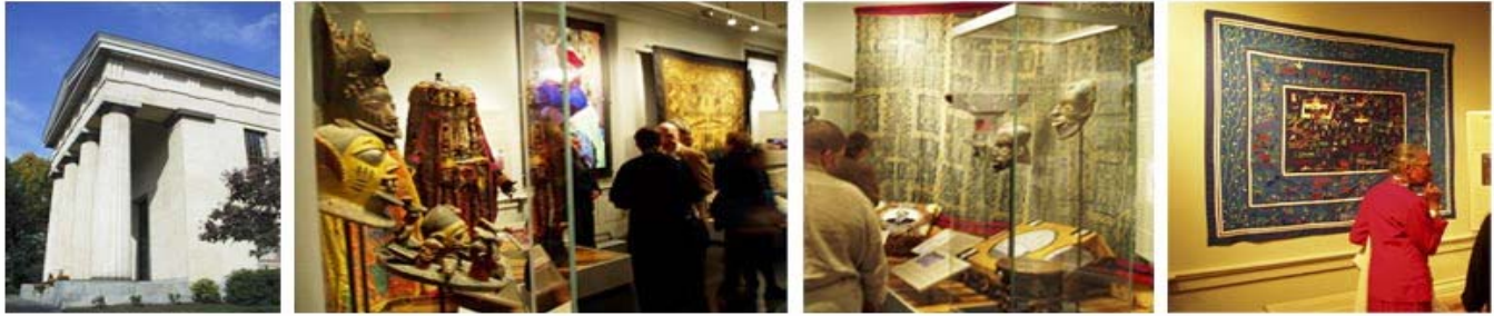
Haffenreffer Museum Display Project, Manning Hall