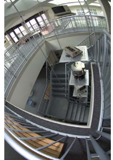
The RI Historical Preservation & Heritage Commission presented a Preservation Project Award to the University for the restoration of the Computing Laboratory.

and Merrill (SOM) for the Sidney Frank Hall project. We are currently working with them on programming and design; schematic designs are scheduled to be reviewed in the fall. Architect Toshiko Mori for the addition and renovation of the historic Pembroke Hall building; see rendering on Page 2. ShoP Architecture was selected, after a design competition, for the Jonathan Nelson Fitness Center; see photograph of model on Page 2. ARO was selected for the Study Center in Sciences Library.