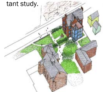
Pembroke Center rendering

on a Materials Handling Plan. This will be a critical aspect of our growth, as we do away with “dumpster alley.” Thanks for your help with this important study.