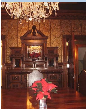
Top and above, holiday decorations at Maddock Alumni Center