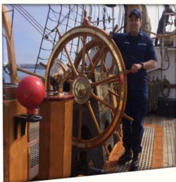
USCG Barque Eagle, 2018, Volvo Ocean Race