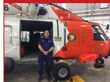
Coast Guard Air Station, Bourne, MA, 2018