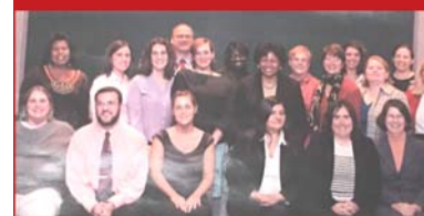
Brown University Ambassador's Program