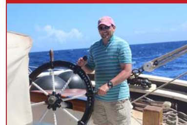
At the Helm of the S/V Roseway, 2016