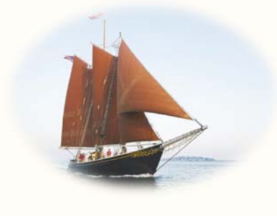
S/V Roseway, 2016