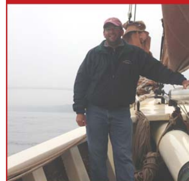
On Deck of the S/V Roseway, 2016