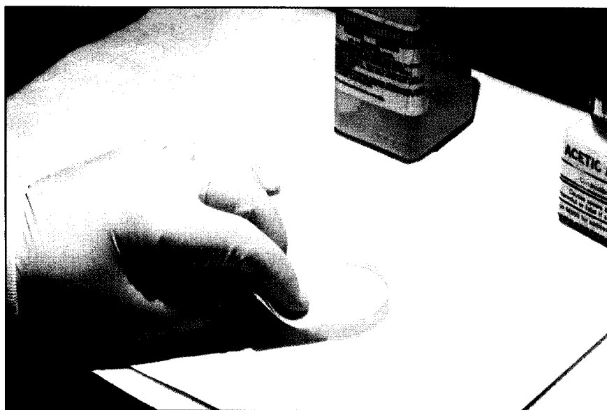
The wipe technique should involve smooth and continuous motions of the lens tissue across the optic.

The wipe method is recommended to remove fingerprints and other embedded residues on uncoated surfaces or durable coatings. This technique uses a clean lens tissue or wipe folded into a brush and grasped near the fold with a hemostat, fingers or tweezers. Several drops of solvent are placed on the fold, and the excess is shaken off. With gentle, uniform pressure, the brush is wiped slowly from one edge of the optic to the other