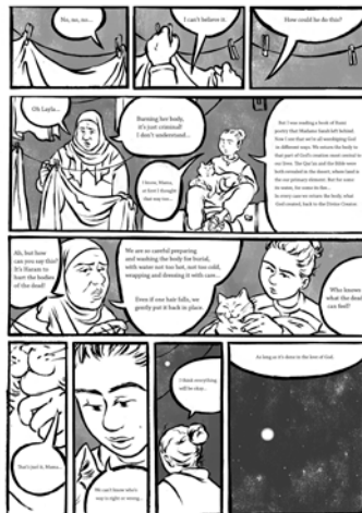
A page from the graphic novel, Lissa (Still Time)