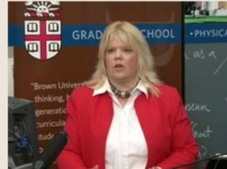
Applying for External Fellowships: "Javits and Other External Resources"