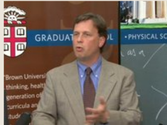
Applying for External Fellowships: "Timing is Everything - Preparing a Proposal"

The Graduate School has launched a video series detailing the process of applying for external fellowships.