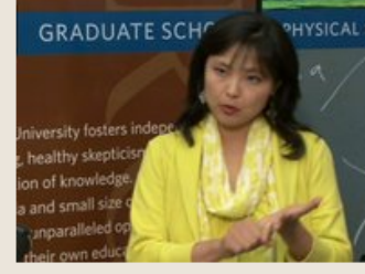
Applying for External Fellowships: "Submitting a Proposal to the Office of Sponsored Projects: NSF and other Federal Grants"