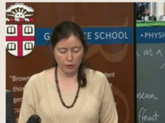
Applying for External Fellowships: "Searching for External Funding Opportunities"