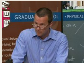
Applying for External Fellowships: "Writing a Better Proposal: Using the Writing Resource Center"