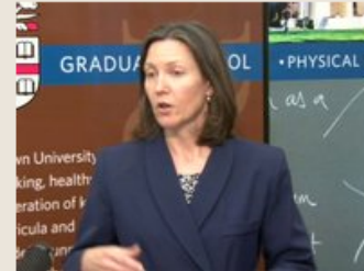
Applying for External Fellowships: "Protecting Research Participants"